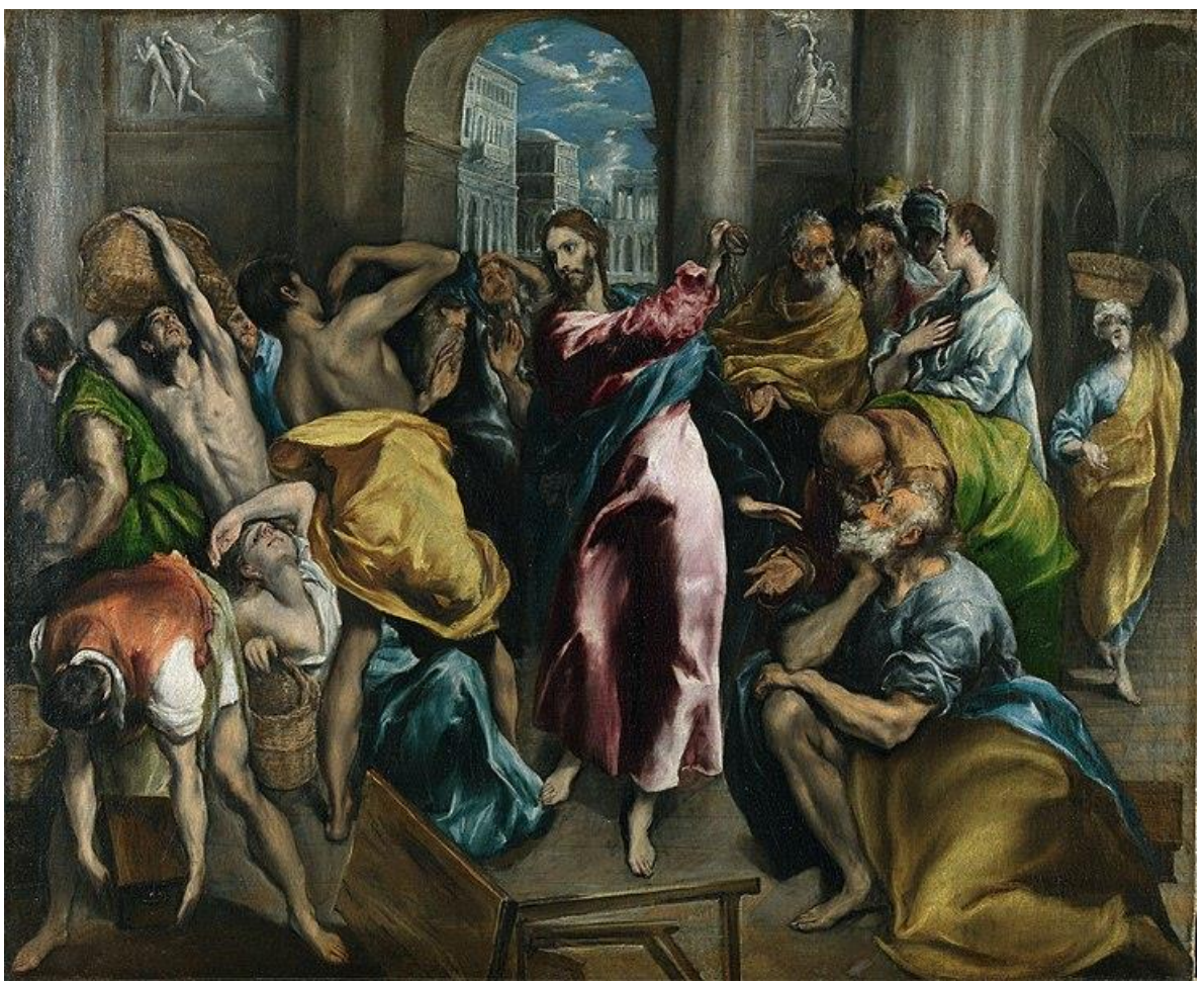
Christ driving the Traders from the Temple, El Greco, circa 1600